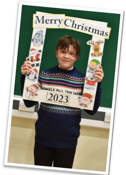
Some of our Christmas Jumper 2023 winners