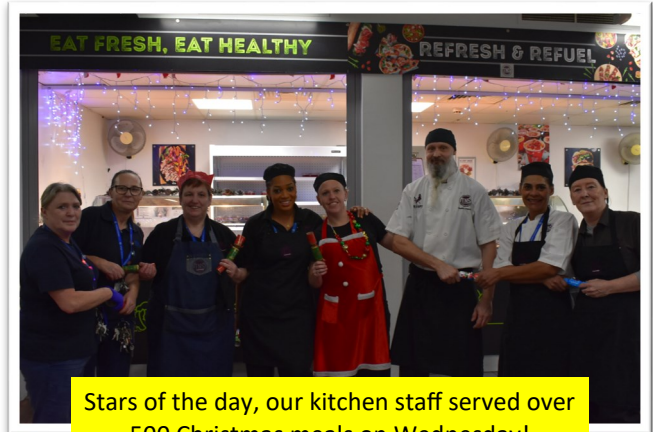
Stars of the day, our kitchen staff served over 500 Christmas meals on Wednesday!