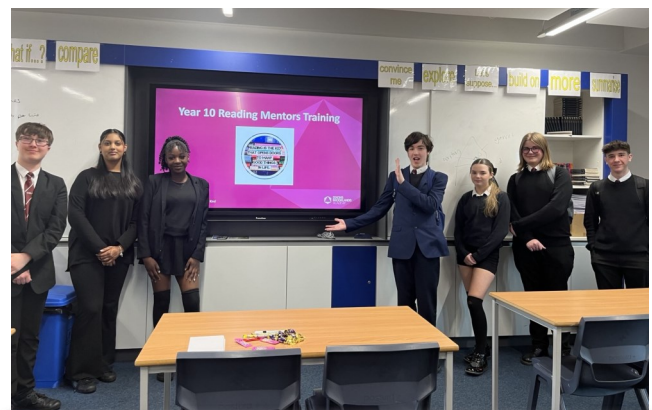
Some of our Year 10 Reading Mentors

The Reading Mentors have been learning about why reading fluency is linked to academic success, happiness and mental wellbeing. They've also been deliberately practising practical strategies to use with their paired student and how to check for understanding.